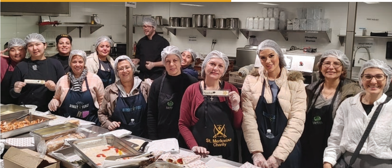
PICTURED: STUDENTS IN OUR HOSPITALITY COURSE

Empowered women with employable skills in collaboration with the NSW Government.