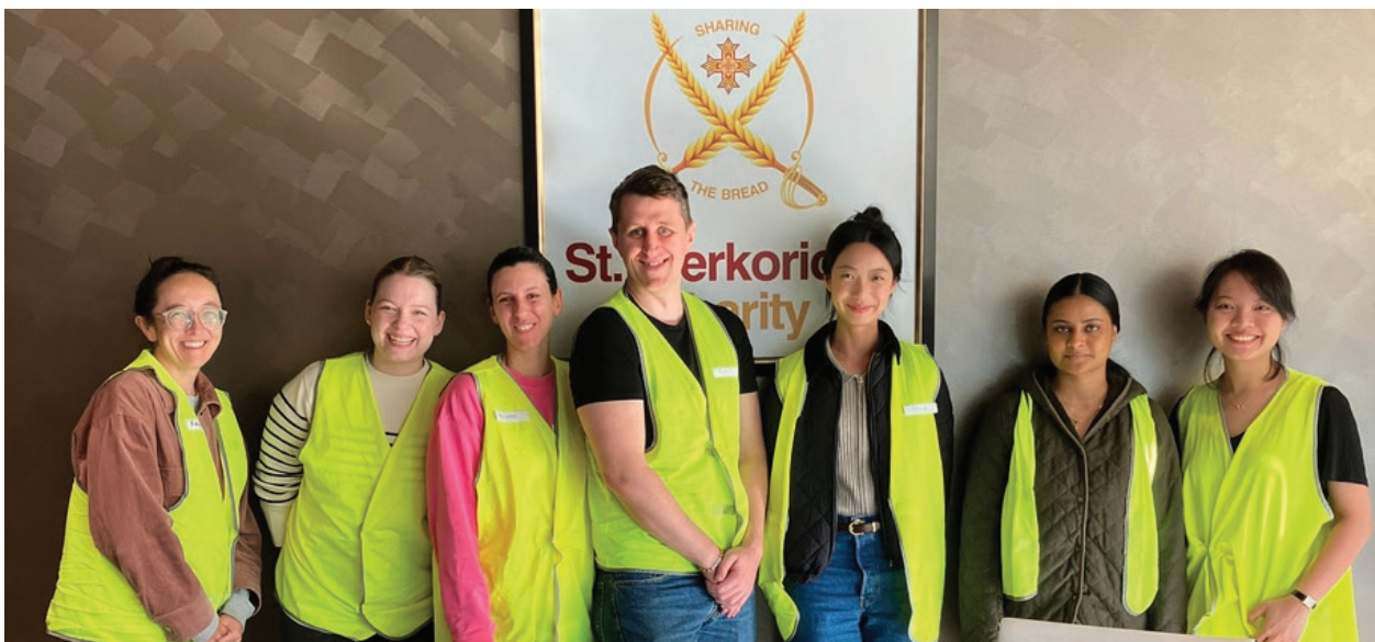
PICTURED: KPMG STAFF VOLUNTEERING THROUGHOUT THE YEAR