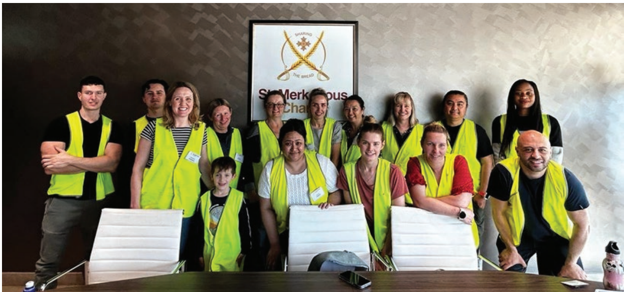
PICTURED: NESTLE STAFF VOLUNTEERING SEP 2023

Volunteers from KPMG, Westpac, Montessori Academy, and schools like Santa Sabina College and St. Patrick's College played pivotal roles in supporting outreach programs and events.