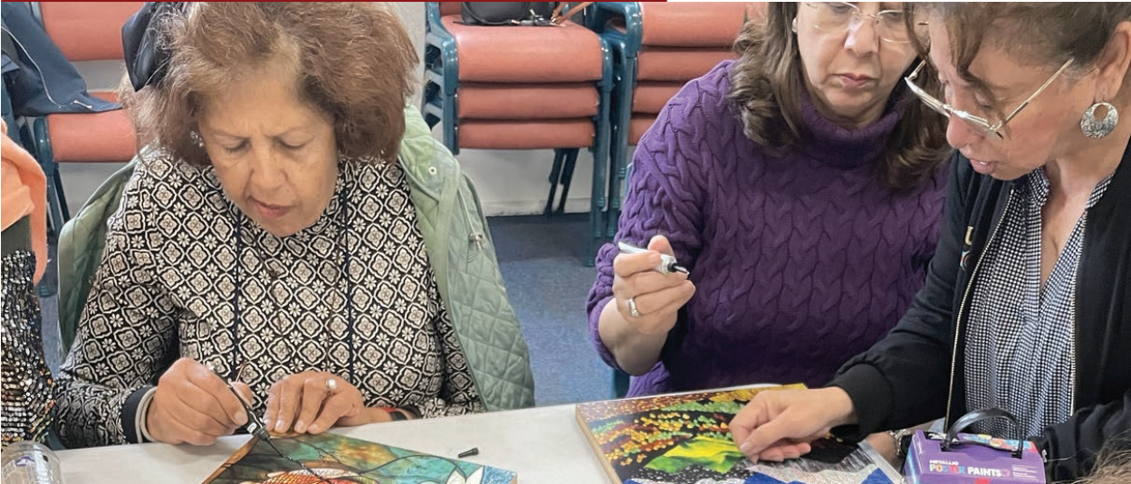
PICTURED: AMAZING ART WORK DONE BY SOME OUR CLIENTS

Fostered creativity and connection in collaboration with Canada Bay Council who granted us $2,500. The course was conducted by the famous artist Safaa Shaker.